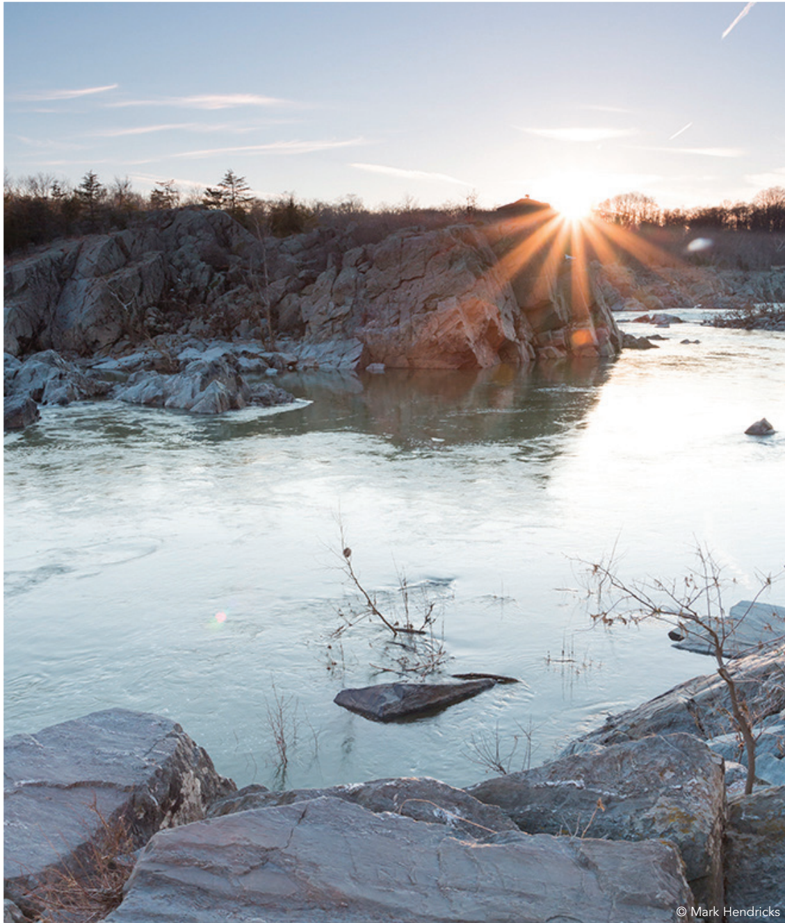
Chesapeake & Ohio Canal-Great Falls, Potomac, Maryland

Similar to members of the Armed Forces, the Department of Natural Resources (DNR) knows the importance of hard work and planning for the future. Our employees, along with our partners and sister agencies, are trailblazers in their fields, working together to manage our natural and living resources for the long-term in ever-increasingly innovative ways. We encourage military families, particularly our Wounded Warriors, to visit some of the serene natural and living resource areas located right here in Maryland. For additional information about DNR events, activities and other items of interest, visit http://www.dnr.state.md.us/newsletter/newsletter.asp . dnr.maryland.gov