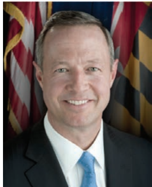
MARTIN O'MALLEY GOVERNOR

STATE HOUSE 100 STATE CIRCLE ANNAPOLIS, MARYLAND 21401-1925 (410) 974-3901 (TOLL FREE) 1-800-811-8336 TTY USERS CALL VIA MD RELAY GOVERNOR.O'MALLEY@MARYLAND.GOV